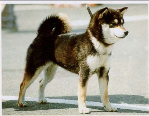
Black & Tan Shiba

When adults visit a home with Shiba puppies, they usually sit and wait for the puppies to come to them. Children tend to pursue the puppies. Shibas do not like to be continually restrained and manhandled. Although a well socialized puppy will tolerate some of this, too much will make him shy or irritated. It is absolutely necessary that a child learn to sit and let the puppy come to him. It is difficult to train a child, who is used to running in and out of the house at will, to close the door quickly and make sure the Shiba doesn't get out into an unfenced area. It is even more difficult to train the child's friends. Training the child when he is little can make him aware of the necessity of using a double door system or exercising caution when going in and out. But