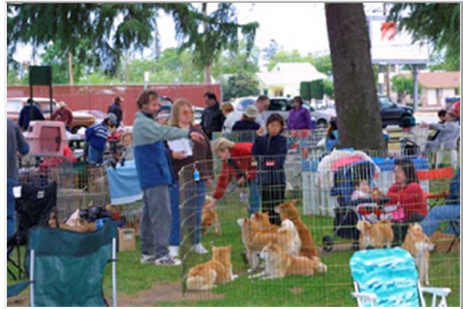
It's a Shiba owner's support group!

The best place to learn about Shibas is from other Shiba owners. There are no dumb questions. Just ask. The breeder of your puppy should be your primary source of information. Sometimes this is difficult as the breeder may live far away or be extremely hard to contact. Ask the breeder for names of other Shiba owners in your area and feel free to contact them. People love to talk about their dogs. Organize a gathering of Shiba owners in your area and have a potluck